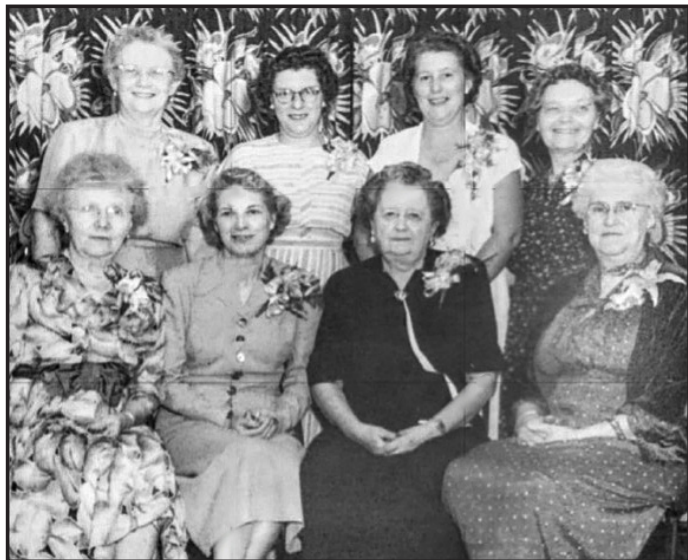
Original Garden Club Members 1941