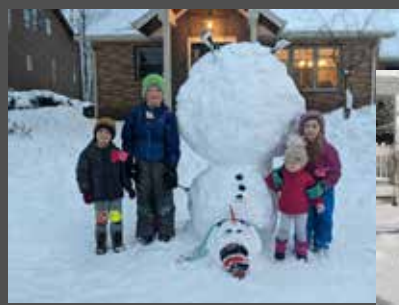
Snowman Making Contest