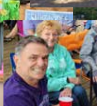
Cardboard Boat Regatta