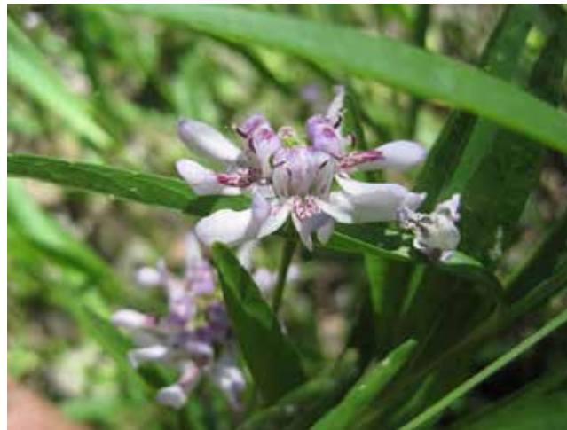
American Water Willow

https://garden.org/plants/view/82756/American-Water-Willow-Justicia-americana/