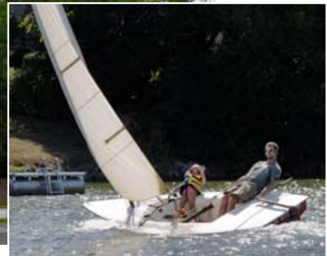
Original photo entry picture!