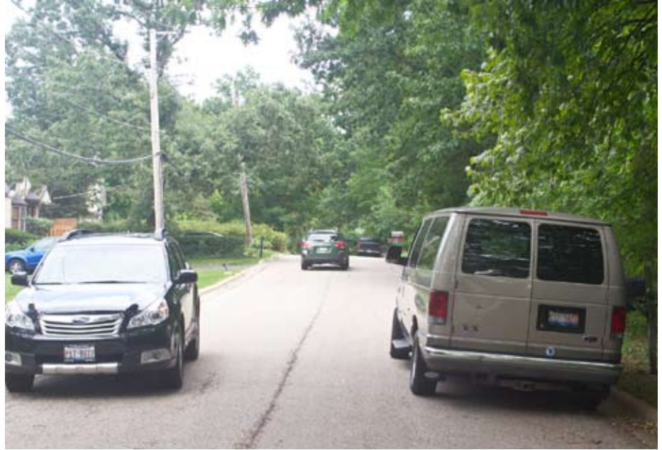
Can an emergency vehicle make it?

Please look at this picture taken on South Sylvan. No ambulance could pass between these two vehicles. Fire trucks and ambulances can enter Sylvan Lake at any time. With no room to pass, they will be delayed in responding to a neighbor who has called for help. Safety first! Our roads are narrow! Check where your guests park and make sure there is room for emergency vehicles to pass."