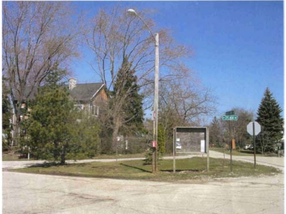
Old Triangle Spring 2010 - roads form a complete triangle, bulletin board and street light and landscaping to be improved.

Even though Beach Point is not complete, it's already becoming a beautiful focal point for those who enter Sylvan Lake.