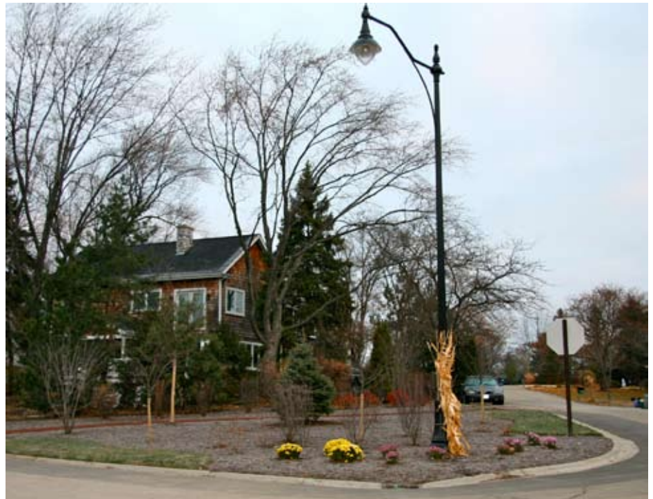
Beach Point in Nov. 2010 - road removed to form a point instead of a triangle. Bulletin board remove although a new board is in the planning, a new ornate street light has been added and landscaping.