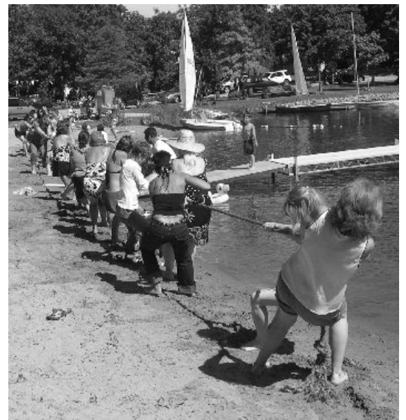
Women's Tug-O-War contest