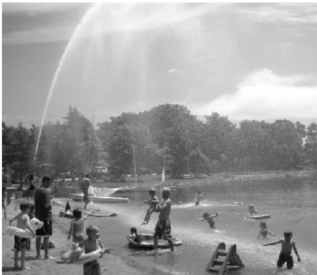
Fire truck fountain