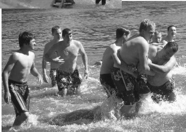
Men's greased watermelon contest