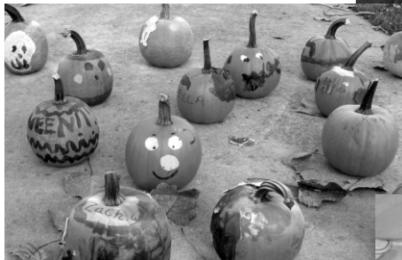
Some of the painted pumpkins.